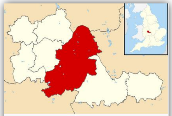
Birmingham shown within the West Midlands county