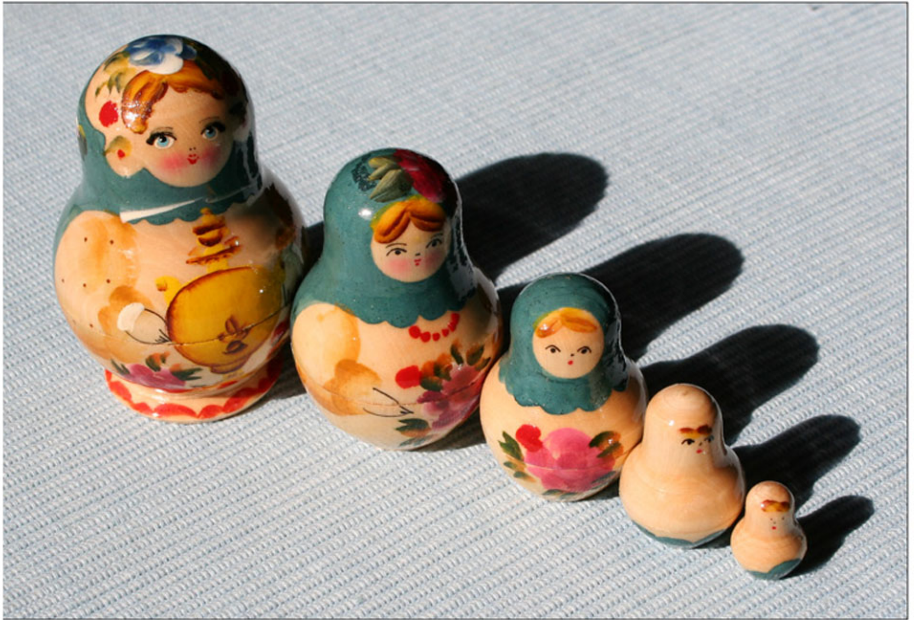
five small shadows | ray allen